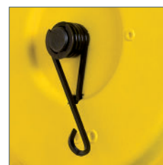
Adjustment of spring tension YFS-03/04/05 with central shaft and spring lever